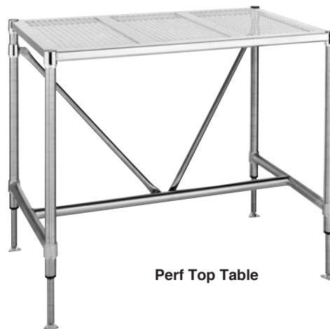
Perf Top Table