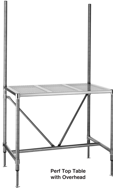
Perf Top Table with Overhead